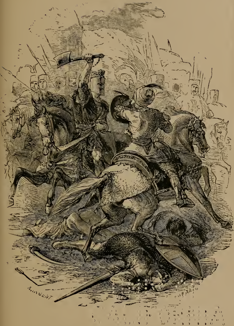
St. Andrew of Scotland.